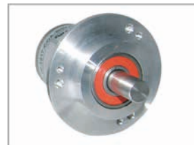
Absolute encoder WDGA58B