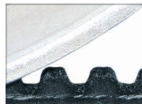
Special belt for exceptionally quiet, non-slip measuring.