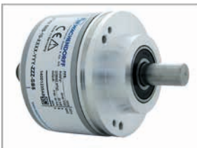
Incremental encoder WDG158B

Put together your own system for shaft copying, by selecting an encoder and specifying the length of the special belt.