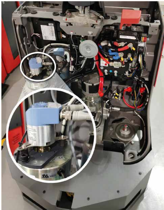
Figure 2: Redundant encoder WDGR 58B for speed detection.

Reliable speed control is essential for an AGV. Depending on the speed, the protective fields of the AGV are also extended. As soon as the protective field is disturbed, the AGV must safely reduce its speed. A WDGI 58A incremental encoder can be used to determine a safe speed value. The encoder is mounted directly on the wheel and the values are compared with the controller. Wachendorff also offers redundant incremental encoders with integrated optical and magnetic independent sensor systems.