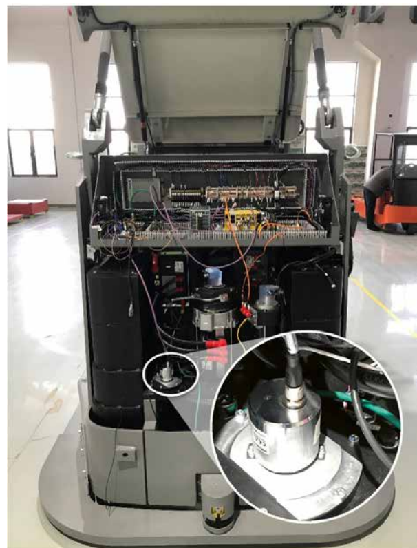
Figure 3: WDGA 58E for detecting the angle of rotation of the steering motors.

By using a Field Programmable Gate Array (FPGA), Wachendorff's Universal-IE encoder can activate an Industrial Ethernet protocol via a web server. The choice is between the three most common protocols such as PROFINET, EtherCAT and Ethernet/IP. By using a single hardware for all protocols, the user has maximum flexibility. Future updates can also be imported via the integrated web server. Protocol selection is quick and easy.