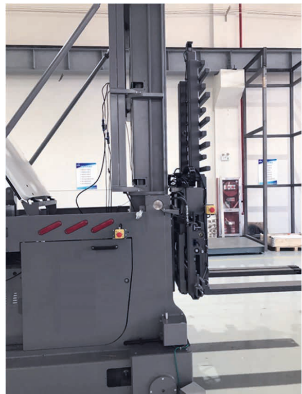
Figure 1: SZG165 draw-wire system for precise positioning

measured value is cross-correlated with the reference value to produce a more accurate value. A suitable calculation of the magnetic field generated by a diametrical magnet cancels out any interference from the Hall sensors. This allows the use of magnetic singleturn technology in dynamic and high precision applications.