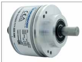
Incremental encoder WDG158B

Put together your own unit for shaft copying, by selecting an encoder and specifying the length of the special belt.