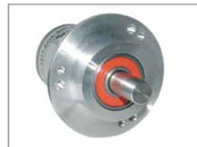
Absolute encoder WDGA58B