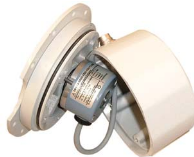
Hollow shaft encoder with mounting bell