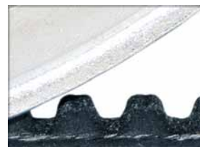
Special belt for exceptionally quiet, non-slip measuring.