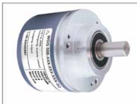
Incremental encoder WDG58B

Put together your own system for shaft copying, by selecting an encoder and specifying the length of the special belt.